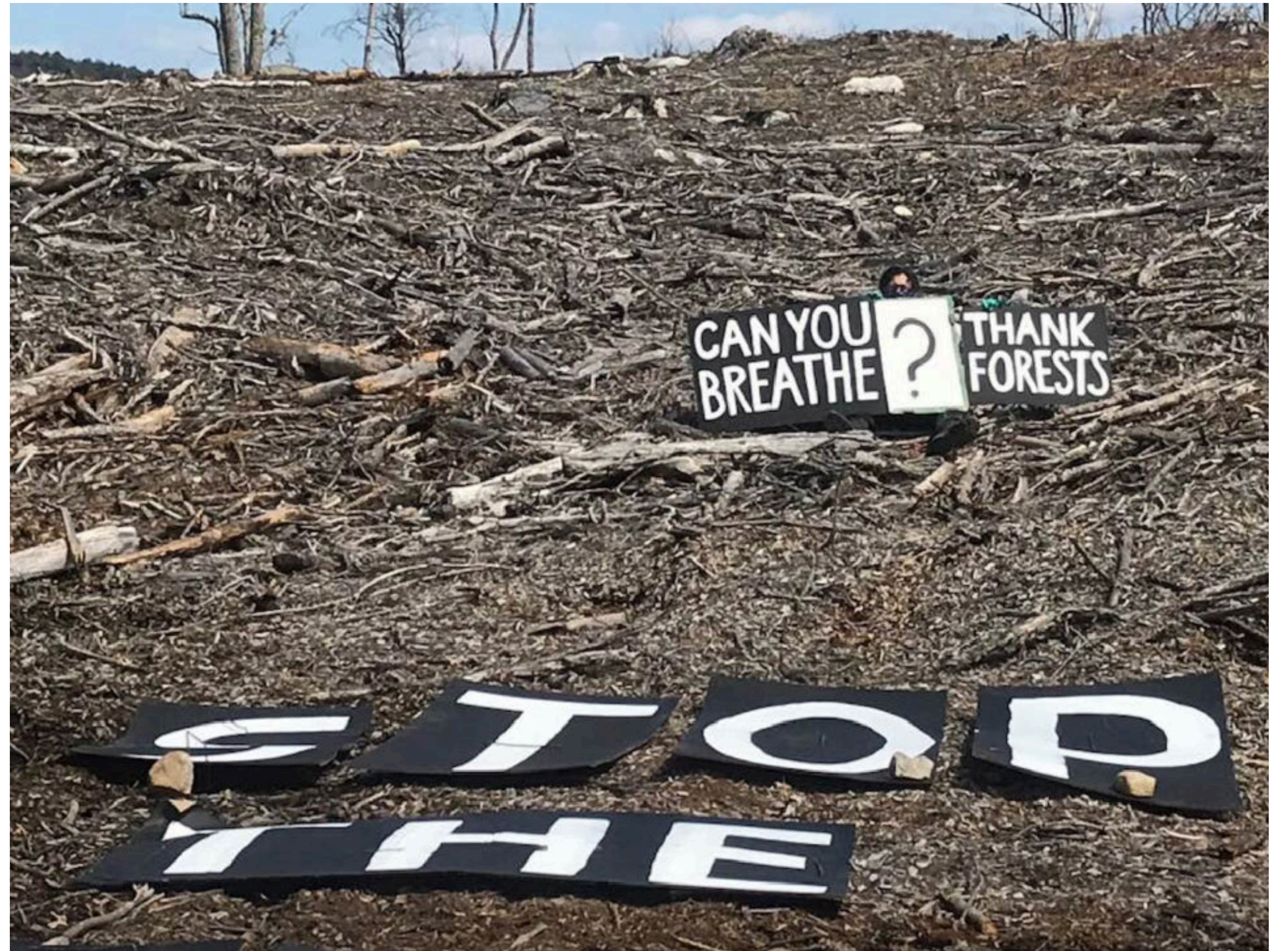
April 17, 2020: Greenwich Rd, Hardwick MA with 20,000 acres more to be cut

After you send your Letters — share them with people in your Spheres of Influence!