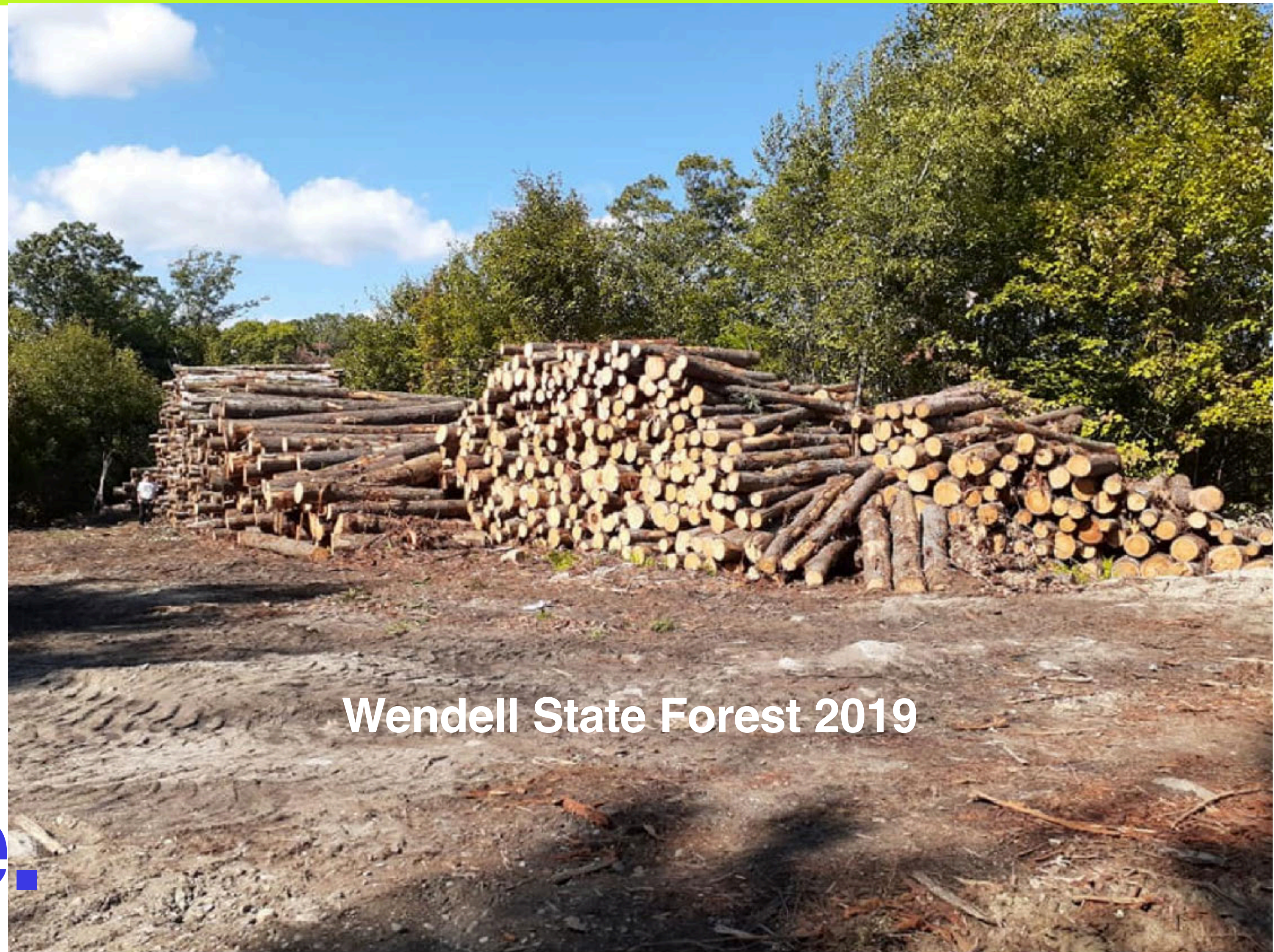
Wendell State Forest 2019

ASK THEM TO DEFUND THE MFP AND TELL THEM WHY